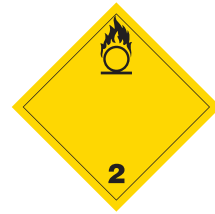
Oxygen & Oxidizing Gas