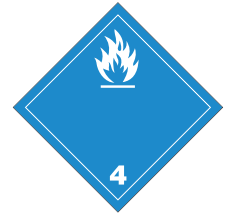
Dangerous When Wet