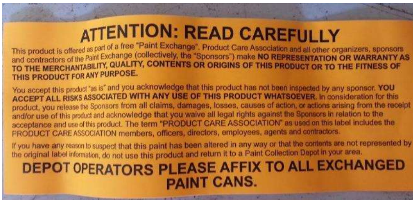
FIGURE 1: PAINTSHARE STICKER IN USE

*If customer asks, please reassure them that the information collected on this form is only used if Product Care needs to confirm they did indeed take paint for re-use or if they have a concern regarding the transaction and/or the liability waiver.