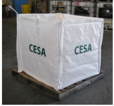
48"l x 48"w x 48"h (including pallet)