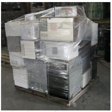
48"l x 48"w x 40-60"h (including pallet)