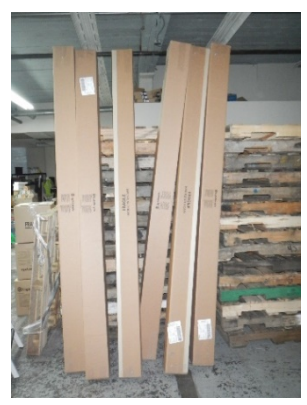
96"l x 10"w x 10"h