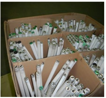
48"l x 40"h x 52"h (including pallet)