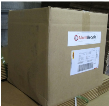
14"l x 14"w x 14"h