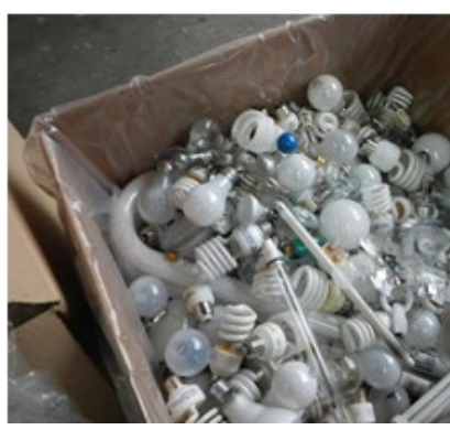
24"l x 20"h x 24"w