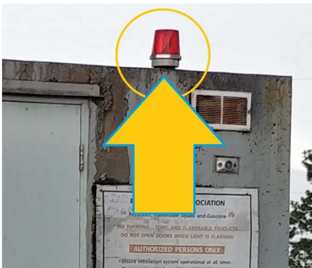
Warning Light. Keep this area clear so light is visible from all angles