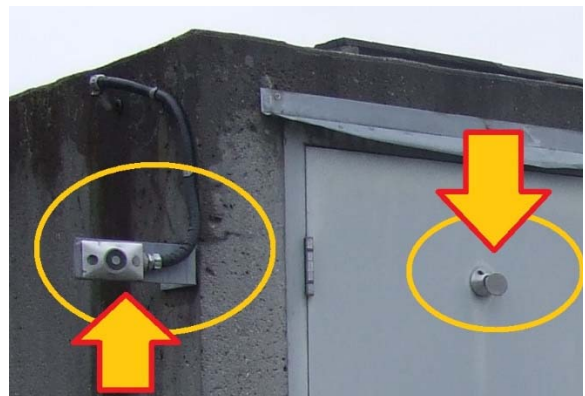
Magnetic door holders. May require manual adjustment so the magnet piece on door is flush against wall mounted magnet when.