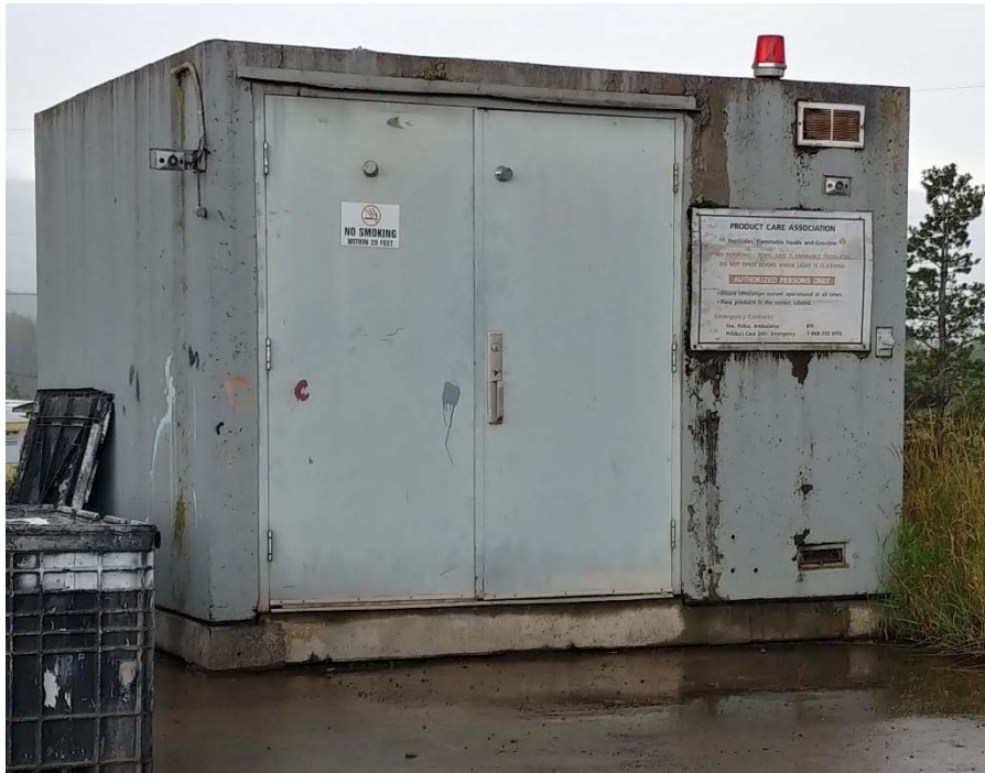
HHW concrete Storage Room