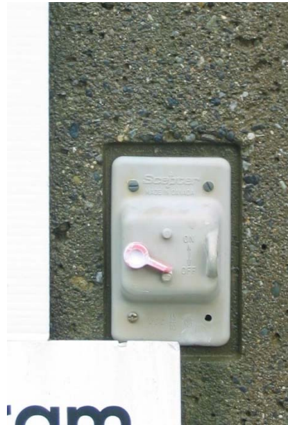
Light switch for inside light