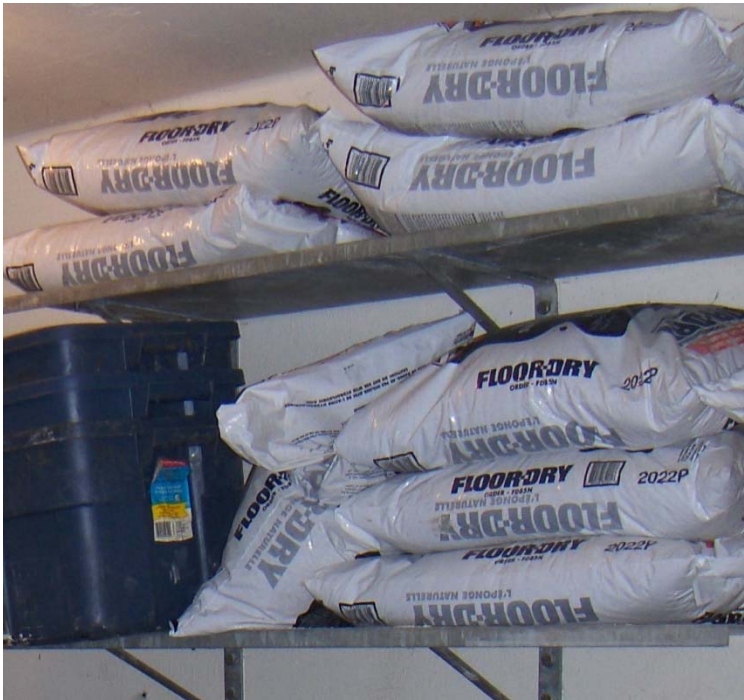
Shelves inside room can be used to store floor dry