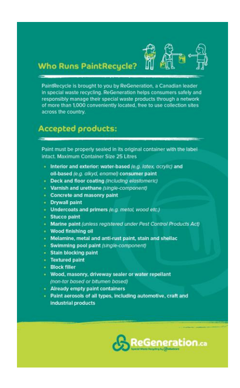
Posters - 11" x 17"