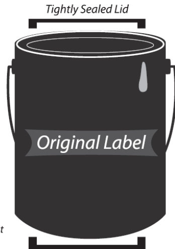
Original Container in Reasonable Condition